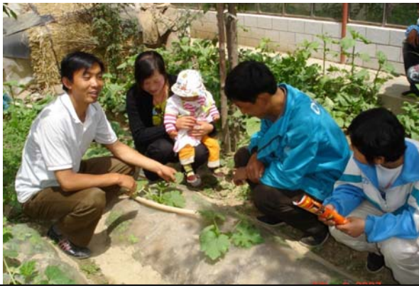
Our LiJiaShan High School Librarian doing outreach programs at local farms.