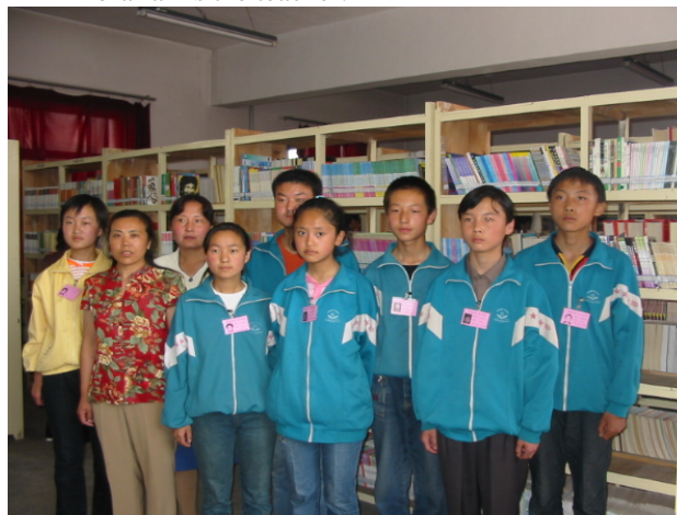
Our Scholarship Students at Tianzhu's YiZhong serving as volunteers in the school library

Your Views and Suggestions are Important to Us.