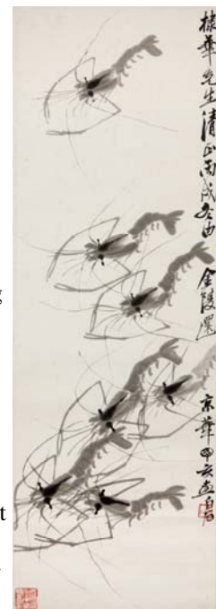
Qi's Seven Shrimps